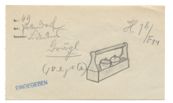
Figure 1. Voucher to be digitized in the DBÖ

Most of these data is already stored electronically. However, the so called Database of Austrian Dialects and Names (DBÖ) does not meet the needs of modern electronic storage of data. Therefore and for the reason to create new possibilities of data-access the project dbo@ema was designed by the project leader in 2006<sup>2</sup>: A new system is going to be established and data are transformed into this new system.